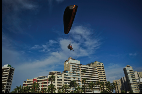
Leading performers: Barcelona in Spain (top) and Lima in Peru (bottom)