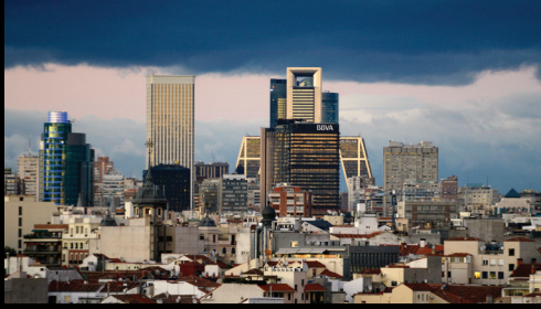
Making deals: Medellín in Colombia (top) and Madrid in Spain (bottom)